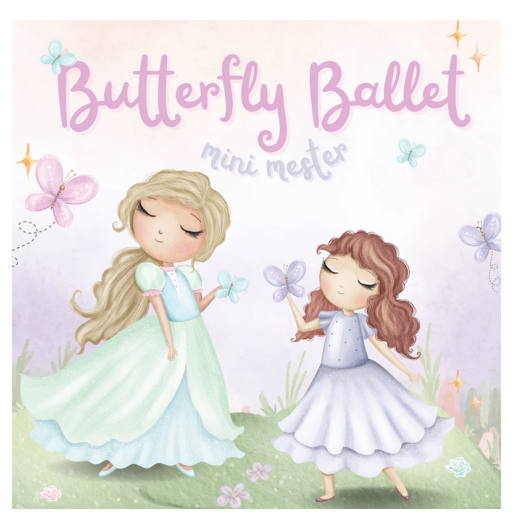
Butterfly Ballet: Ballet Session 1: Sept 16-Oct 21 Every Saturday, 9:15-10 am