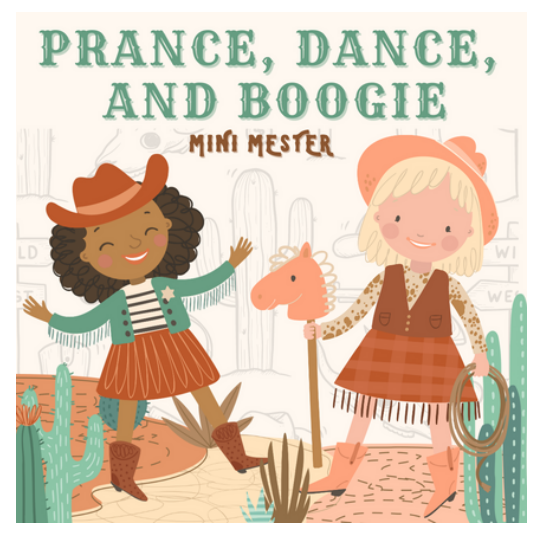
Prance, Dance, & Boogie: Jazz Session 2: Oct 28-Dec 9 (skip Thanksgiving) Every Saturday, 9:15-10 am