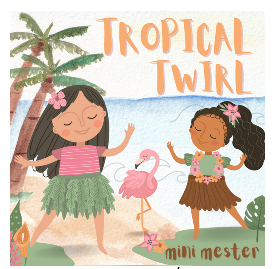
Tropical Twirl: Ballet/Creative Movement Session 4: Feb 24-March 23 5 Weeks for $50 Every Saturday, 9:15-10 am