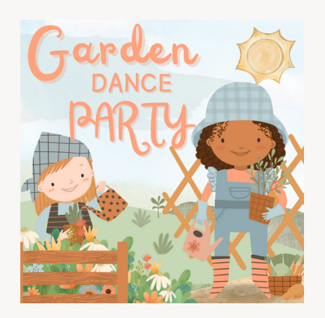
Garden Party Style: Ballet July 22 Ages 3-4: 10 am- 12 pm Ages 5-7: 10am-12 pm