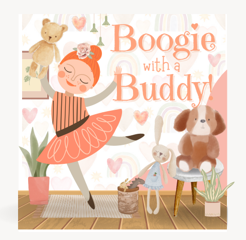
Boogie With a Buddy Style: Ballet/Jazz August 12 Ages 3-4: 10 am- 12 pm Ages 5-7: 10am-12 pm Bring a stuffed animal or doll to dance with!